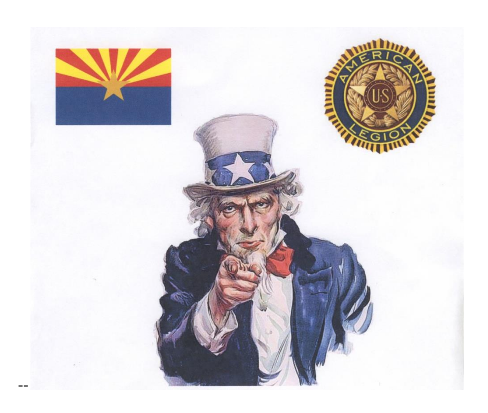
Have you signed up a NEW member for 2026?

<u>Forwarding Service Requested – May</u>