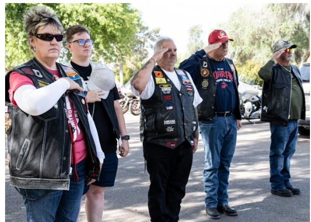
Post 96 and Post 62 Legion Riders