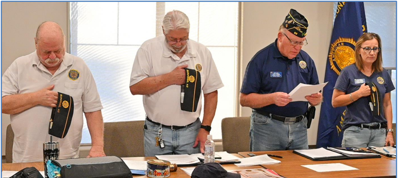
The elected officers for 2024-2025 Legion Year.

ALR Chapter 96 will be meeting after the Post meeting on June 27 at AZ Traditions