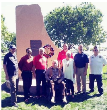
City Council and dignitaries at the WWII Army Air Corps Monument by the lake. Photo from 2019 ceremony

Next, for many years Post 96 and The Marine Corps League White Mountain Detachment held a wreath laying and memorial service on the Saturday before Memorial Day, to honor the thousands of men and women who trained at Luke AFB Auxiliary Field #3 during World War 2. The Marine